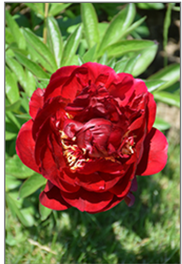
Buckeye Belle Peony flowers