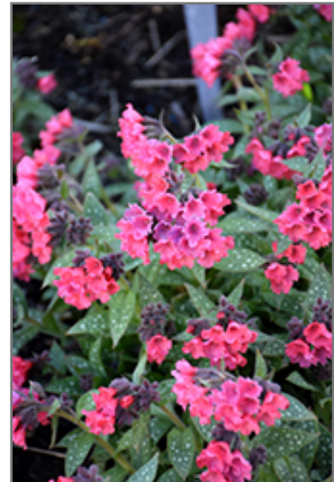
Shrimps On The Barbie Lungwort flowers

Shrimps On The Barbie Lungwort is an herbaceous perennial with a mounded form. Its medium texture blends into the garden, but can always be balanced by a couple of finer or coarser plants for an effective composition.