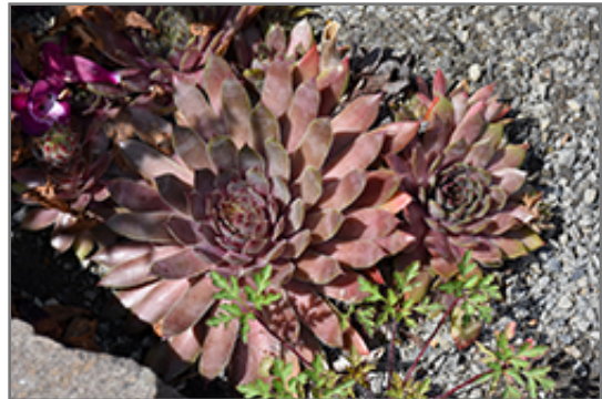
Kalinda Hens And Chicks