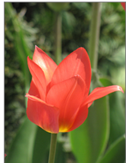
Red Emperor Tulip flowers