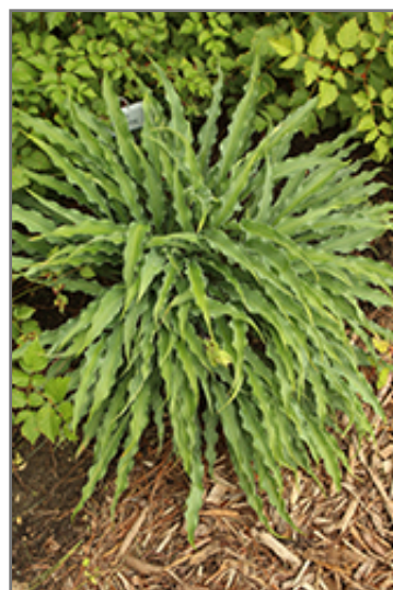
Silly String Hosta