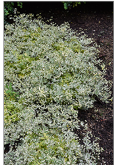
Golden Feathers Jacob's Ladder foliage

Golden Feathers Jacob's Ladder is recommended for the following landscape applications;