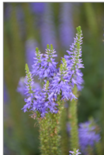
Spike Speedwell flowers

Spike Speedwell is recommended for the following landscape applications;