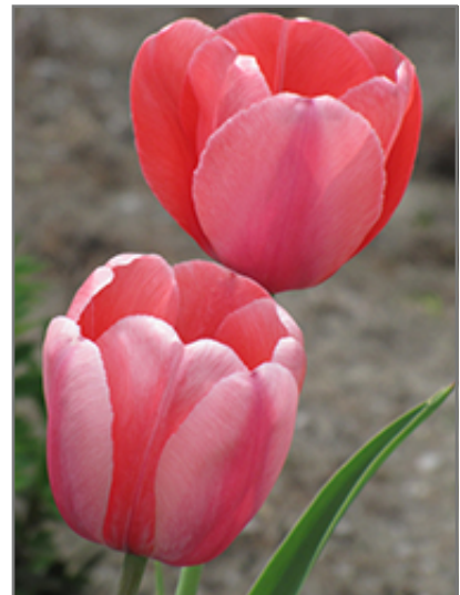
Pink Impression Tulip flowers