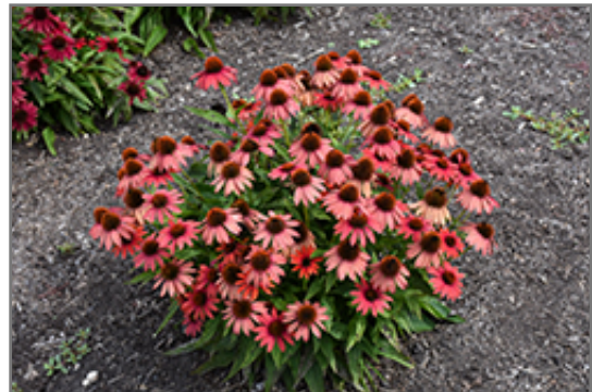
Prima Ruby Coneflower in bloom