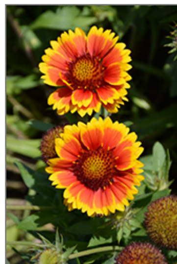
Arizona Sun Blanket Flower flowers

This plant will require occasional maintenance and upkeep, and is best cleaned up in early spring before it resumes active growth for the season. It is a good choice for attracting bees and butterflies to your yard, but is not particularly attractive to deer who tend to leave it alone in favor of tastier treats. It has no significant negative characteristics.