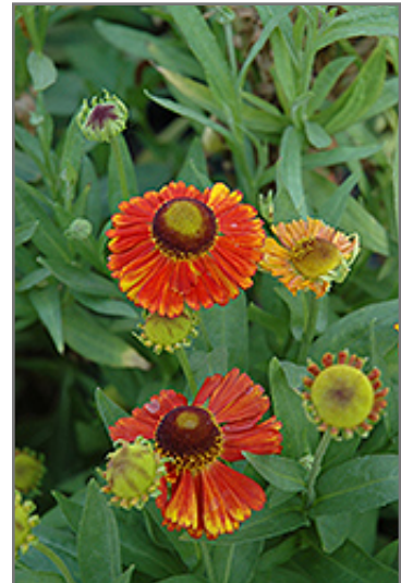
Sahin's Early Flowerer Sneezeweed flowers

Sahin's Early Flowerer Sneezeweed is an herbaceous perennial with an upright spreading habit of growth. Its medium texture blends into the garden, but can always be balanced by a couple of finer or coarser plants for an effective composition.