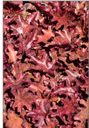
Peach Flambe Coral Bells foliage

Peach Flambe Coral Bells is a dense herbaceous evergreen perennial with tall flower stalks held atop a low mound of foliage. Its relatively fine texture sets it apart from other garden plants with less refined foliage.