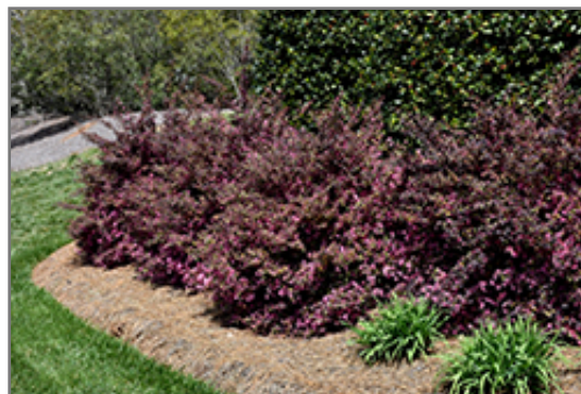
Red-Flowered Chinese Fringeflower in bloom