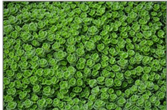
John Creech Stonecrop foliage

John Creech Stonecrop will grow to be only 3 inches tall at maturity, with a spread of 12 inches. When grown in masses or used as a bedding plant, individual plants should be spaced approximately 10 inches apart. Its foliage tends to remain low and dense right to the ground. It grows at a fast rate, and under ideal conditions can be expected to live for approximately 10 years. As an herbaceous perennial, this plant will usually die back to the crown each winter, and will regrow from the base each spring. Be careful not to disturb the crown in late winter when it may not be readily seen!