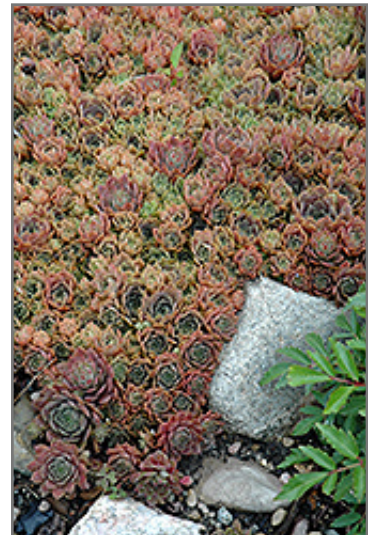
Silverine Hens And Chicks