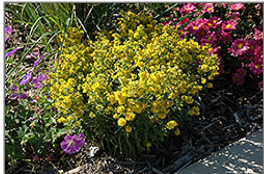
Goldrush Goldenrod in bloom