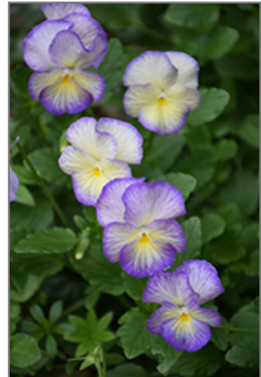
Etain Pansy flowers

Etain Pansy is recommended for the following landscape applications;