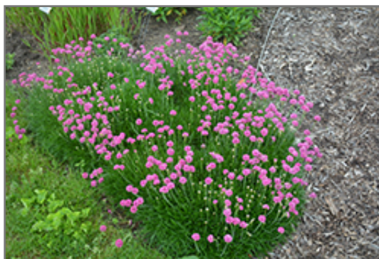
Bloodstone Sea Thrift in bloom