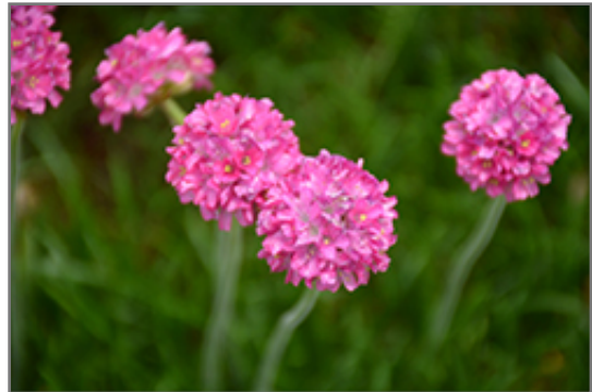
Bloodstone Sea Thrift flowers

Bloodstone Sea Thrift will grow to be only 6 inches tall at maturity extending to 10 inches tall with the flowers, with a spread of 18 inches. Its foliage tends to remain low and dense right to the ground. It grows at a slow rate, and under ideal conditions can be expected to live for approximately 10 years. As an evergreen perennial, this plant will typically keep its form and foliage year-round.