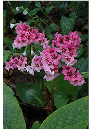
Pink Dragonfly Bergenia flowers

Pink Dragonfly Bergenia is recommended for the following landscape applications;