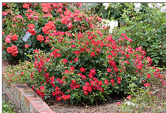
Red Drift Rose in bloom