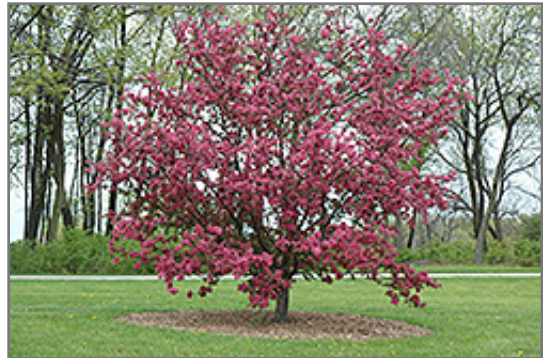
Purple Prince Flowering Crab in bloom

Purple Prince Flowering Crab is a dense deciduous tree with an upright spreading habit of growth. Its average texture blends into the landscape, but can be balanced by one or two finer or coarser trees or shrubs for an effective composition.