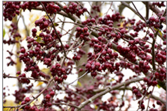
Purple Prince Flowering Crab fruit

This tree should only be grown in full sunlight. It prefers to grow in average to moist conditions, and shouldn't be allowed to dry out. It is not particular as to soil type or pH. It is highly tolerant of urban pollution and will even thrive in inner city environments. This particular variety is an interspecific hybrid.