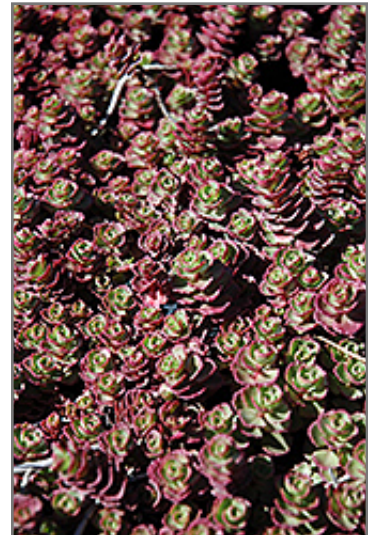
Red Carpet Stonecrop foliage

Red Carpet Stonecrop is a dense herbaceous perennial with a ground-hugging habit of growth. It brings an extremely fine and delicate texture to the garden composition and should be used to full effect.