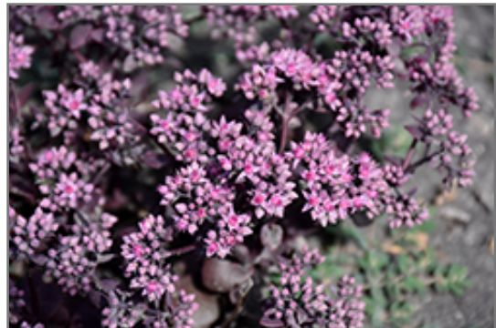
Red Carpet Stonecrop flowers