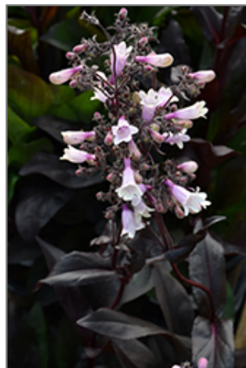
Dark Towers Beard Tongue flowers

Dark Towers Beard Tongue is recommended for the following landscape applications;