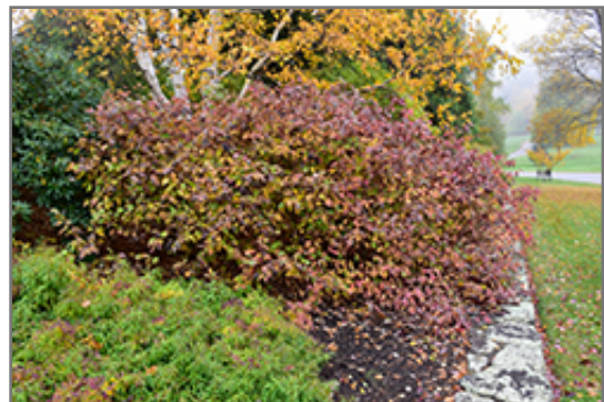
Bailey Red-Twig Dogwood in fall