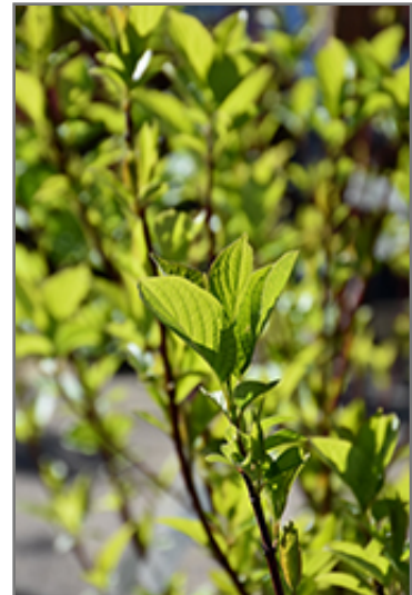
Bailey Red-Twig Dogwood foliage

This shrub does best in full sun to partial shade. It is an amazingly adaptable plant, tolerating both dry conditions and even some standing water. It is not particular as to soil type or pH. It is highly tolerant of urban pollution and will even thrive in inner city environments. This species is native to parts of North America.