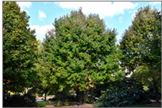
Autumn Flame Red Maple

* This is a 'special order' plant - contact store for details