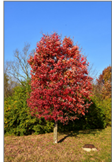
Autumn Flame Red Maple in fall

Autumn Flame Red Maple is recommended for the following landscape applications;