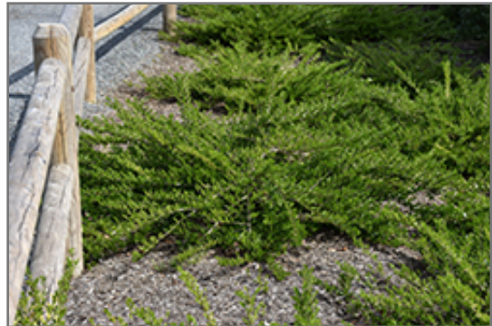
Privet Honeysuckle

This shrub will require occasional maintenance and upkeep, and is best pruned in late winter once the threat of extreme cold has passed. It is a good choice for attracting birds and butterflies to your yard. It has no significant negative characteristics.