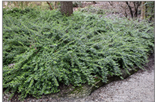
Privet Honeysuckle

Privet Honeysuckle will grow to be about 3 feet tall at maturity, with a spread of 6 feet. It tends to fill out right to the ground and therefore doesn't necessarily require facer plants in front. It grows at a medium rate, and under ideal conditions can be expected to live for approximately 30 years.