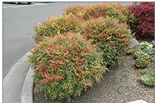
Sienna Sunrise Nandina