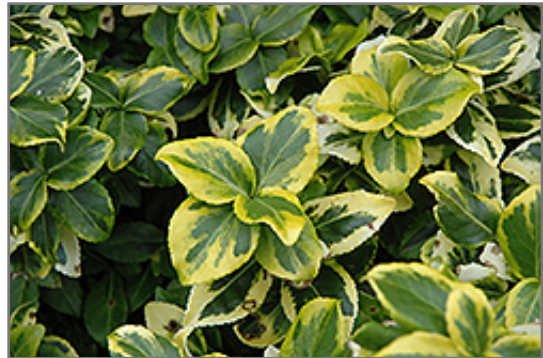
Gold Prince Wintercreeper foliage

Gold Prince Wintercreeper is recommended for the following landscape applications;