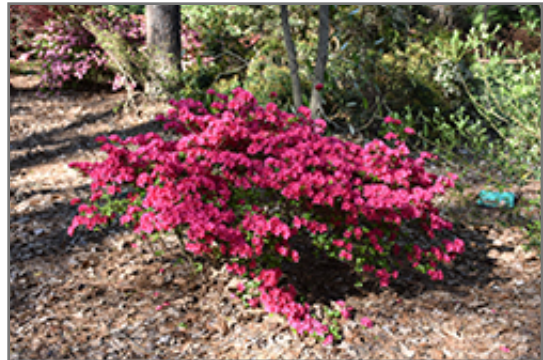
Girard's Fuchsia Evergreen Azalea in bloom