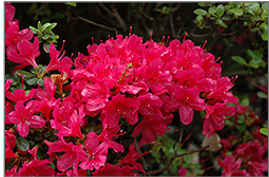
Hino Crimson Azalea flowers

This shrub does best in full sun to partial shade. You may want to keep it away from hot, dry locations that receive direct afternoon sun or which get reflected sunlight, such as against the south side of a white wall. It requires an evenly moist well-drained soil for optimal growth, but will die in standing water. It is very fussy about its soil conditions and must have rich, acidic soils to ensure success, and is subject to chlorosis (yellowing) of the foliage in alkaline soils. It is somewhat tolerant of urban pollution, and will benefit from being planted in a relatively sheltered location. Consider applying a thick mulch around the root zone in winter to protect it in exposed locations or colder microclimates. This particular variety is an interspecific hybrid.