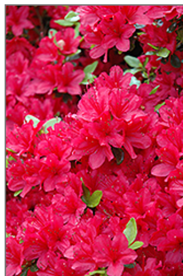
Hino Crimson Azalea flowers

This is a relatively low maintenance shrub, and should only be pruned after flowering to avoid removing any of the current season's flowers. It has no significant negative characteristics.