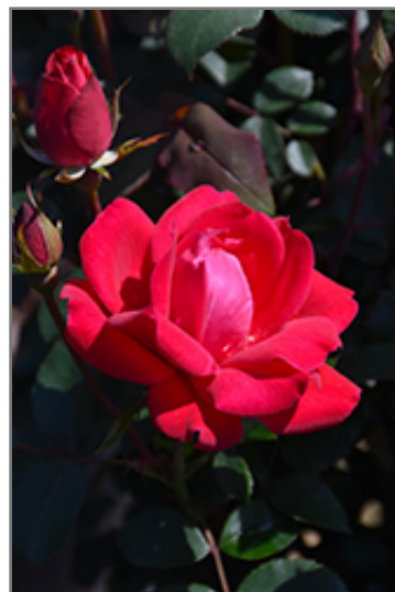
Double Knock Out Rose flowers