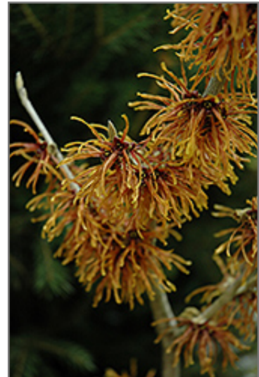
Jelena Witchhazel flowers