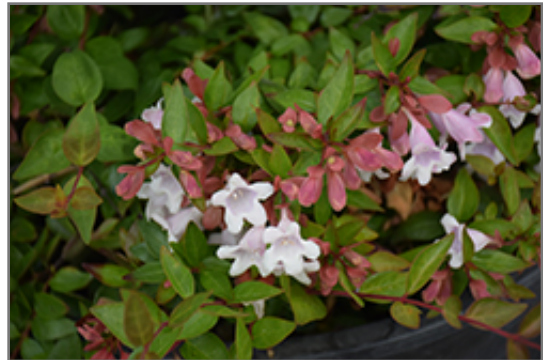
Edward Goucher Abelia flowers

This shrub will require occasional maintenance and upkeep, and should only be pruned after flowering to avoid removing any of the current season's flowers. It is a good choice for attracting birds, bees and butterflies to your yard, but is not particularly attractive to deer who tend to leave it alone in favor of tastier treats. It has no significant negative characteristics.