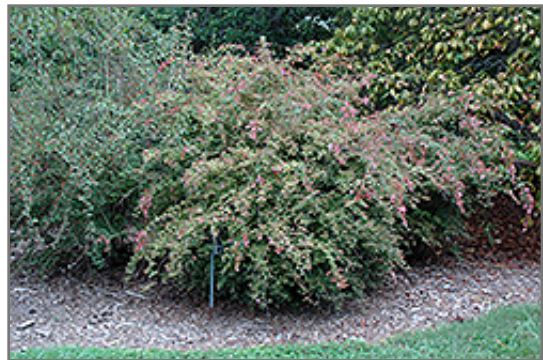
Edward Goucher Abelia in bloom