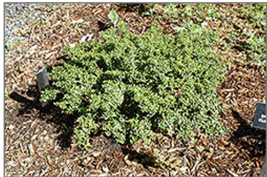
Lemon Gem Dwarf Japanese Holly