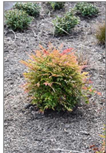
Gulf Stream Dwarf Nandina

Gulf Stream Dwarf Nandina is recommended for the following landscape applications;