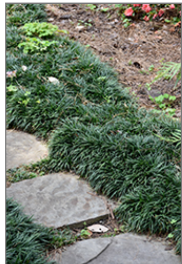
Dwarf Mondo Grass