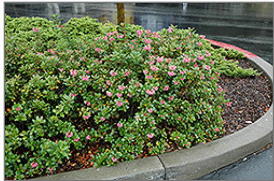
Newport Dwarf Escallonia in bloom