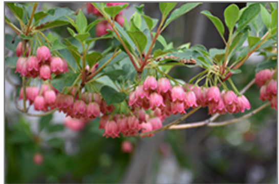
Redvein Enkianthus flowers

Redvein Enkianthus is recommended for the following landscape applications;