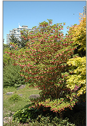
Redvein Enkianthus in bloom