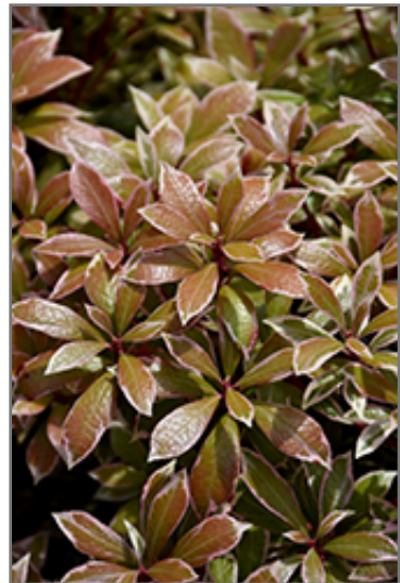
Little Heath Japanese Pieris foliage