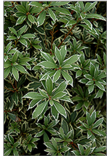
Little Heath Japanese Pieris foliage

Little Heath Japanese Pieris is recommended for the following landscape applications;