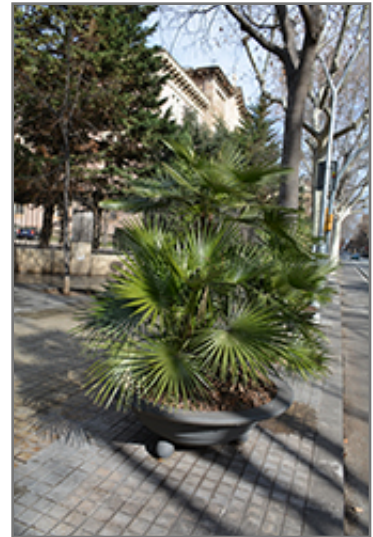
Mediterranean Fan Palm

Mediterranean Fan Palm makes a fine choice for the outdoor landscape, but it is also well-suited for use in outdoor pots and containers. Because of its height, it is often used as a 'thriller' in the 'spiller-thriller-filler' container combination; plant it near the center of the pot, surrounded by smaller plants and those that spill over the edges. It is even sizeable enough that it can be grown alone in a suitable container. Note that when grown in a container, it may not perform exactly as indicated on the tag - this is to be expected. Also note that when growing plants in outdoor containers and baskets, they may require more frequent waterings than they would in the yard or garden.