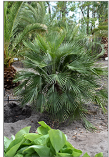
Mediterranean Fan Palm

Mediterranean Fan Palm is recommended for the following landscape applications;