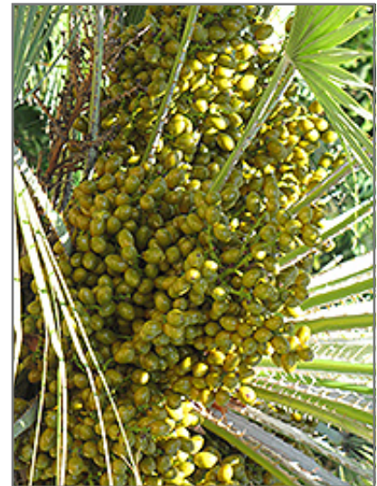
Mediterranean Fan Palm fruit