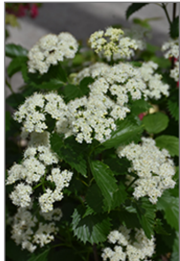
Blue Muffin Viburnum flowers