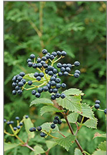
Blue Muffin Viburnum fruit

Blue Muffin Viburnum is recommended for the following landscape applications;