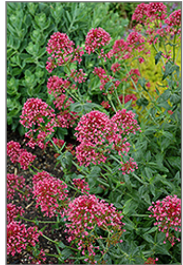
Red Valerian flowers

Red Valerian is recommended for the following landscape applications;