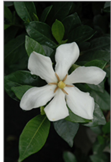
Pinwheel Gardenia flowers