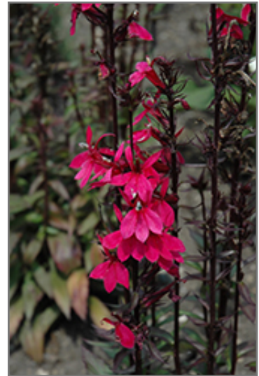
Starship Deep Rose Lobelia flowers

Starship Deep Rose Lobelia is recommended for the following landscape applications;