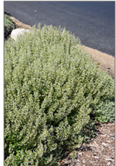
White Cloud Dwarf Calamint in bloom