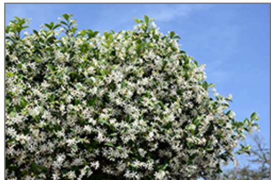
Madison Star-Jasmine flowers