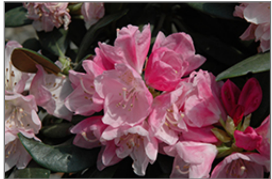
Hachmann's Polaris Rhododendron flowers

This lovely, evergreen shrub is bathed in clusters of beautiful lavender-pink and white blooms emerging from deep red buds; an excellent choice to mass in groupings as an elegant focal point of the garden; must have rich acidic soil