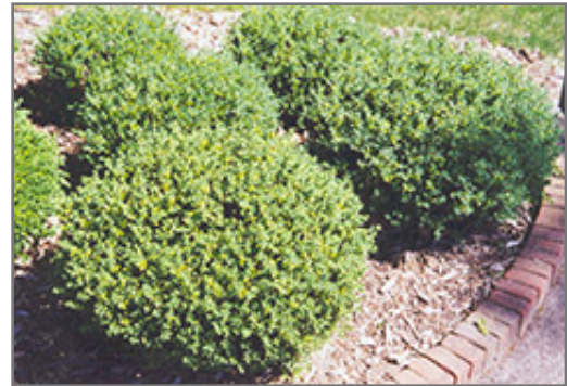
Japanese Boxwood