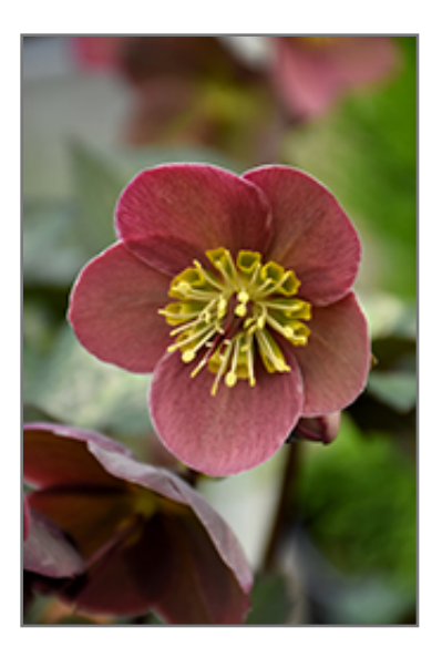
Pippa's Purple Hellebore flowers

Pippa's Purple Hellebore is recommended for the following landscape applications;