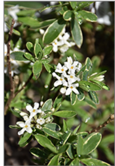
Summer Ice Daphne flowers