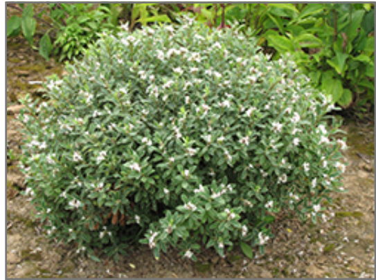
Summer Ice Daphne

Summer Ice Daphne will grow to be about 3 feet tall at maturity, with a spread of 4 feet. It tends to fill out right to the ground and therefore doesn't necessarily require facer plants in front. It grows at a slow rate, and under ideal conditions can be expected to live for approximately 20 years.