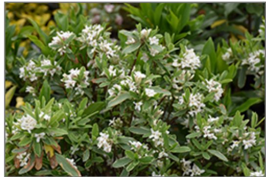
Summer Ice Daphne flowers